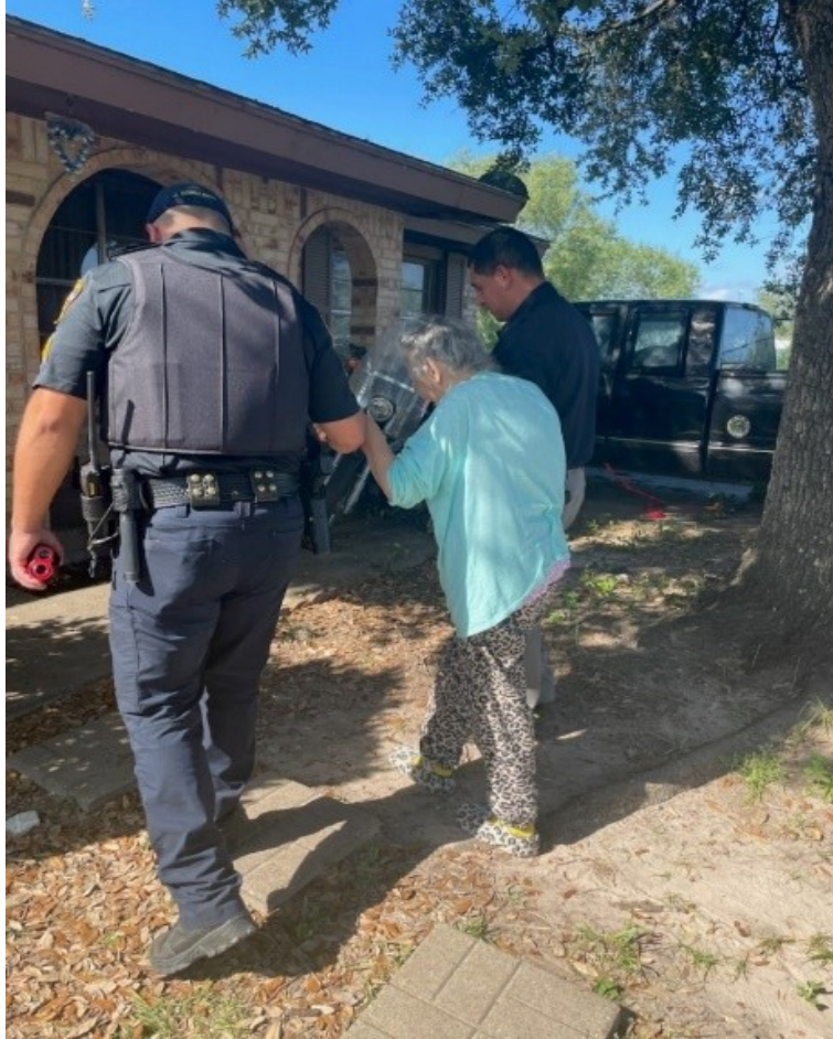
BPD officers assisting an elderly woman to her house