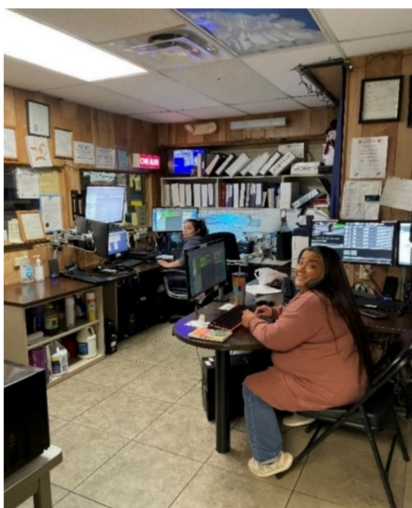
BPD Communications Center

By relaying crucial details such as location, suspect descriptions, and updates to officers in the field, dispatchers ensure officers have the information they need to respond effectively and safely. This collaboration between officers and dispatchers ensures that police, fire, and EMS services can operate efficiently and effectively in all situations.