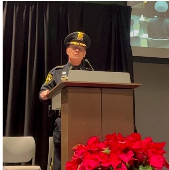
CHIEF BEHR AS KEYNOTE SPEAKER AT CADET GRADUATION 2024